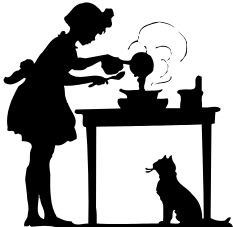
What's for dinner?